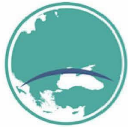
CPMR BALKAN & BLACK SEA COMMISSION