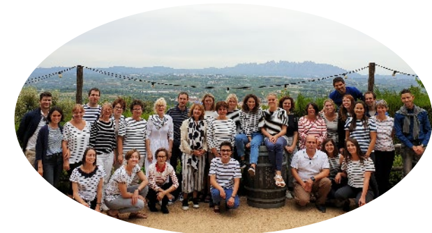
General Secretariat (Brussels)